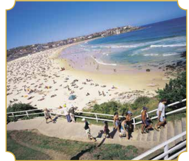
Hamilton Beach; Destination NSW

There are on average 9 hours of sunshine per day throughout this month, with precipitation of around 133mm. You can expect to see rain or drizzle for about 11 days throughout April.